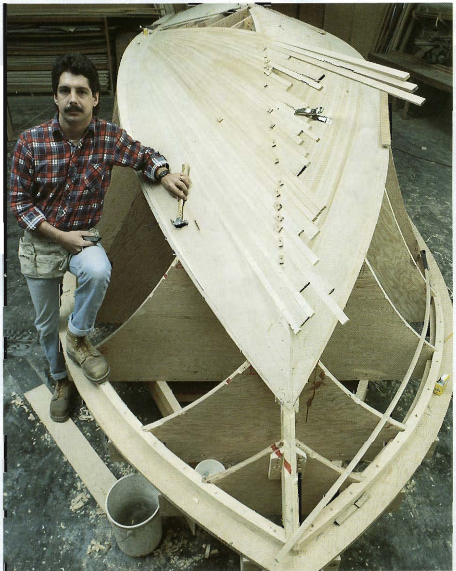
Decades of craftsmanship go into every 1986 Chris-Craft.