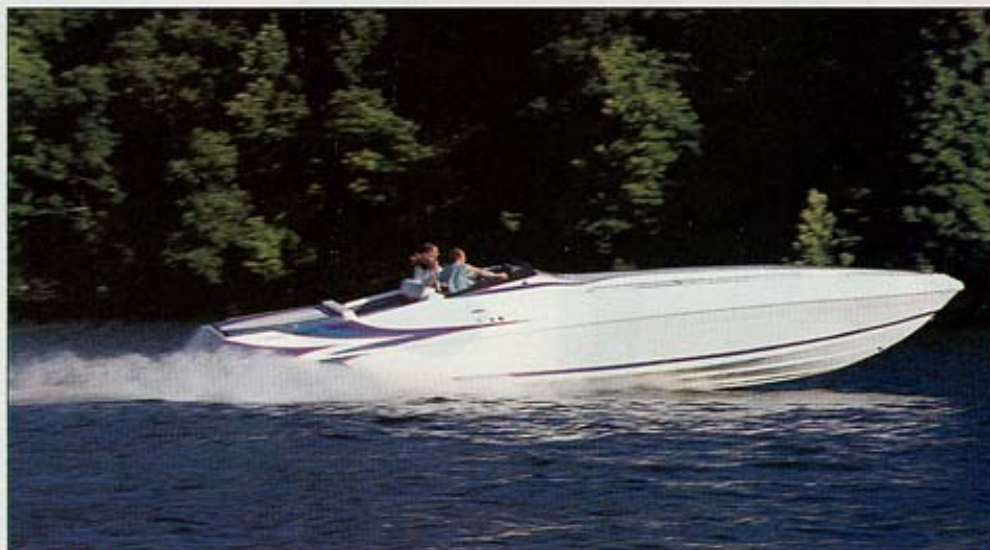
STORMING ALONG: The big Black Thunder XT430 Sport Cruiser hits a top speed of 70 mph.